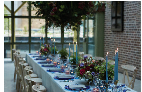
Photo Credits: Top - Hufton + Crow; Bottom L - Museum of the Home; Bottom R - James Wicks